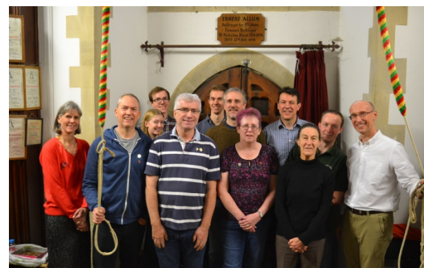
Hurst ringers on November 11 th , including all five of the ringing remembers recruits

One of our development targets was to re-establish a band at Hurst. A successful recruitment initiative, linked to Ringing Remembers, saw a group of five start to learn in September. As three of the Hub’s teachers were able to be involved, the students made good progress, starting to ring rounds on four in October. By November 11 th they were all able to ring rounds on eight, a great achievement that may not have been possible if they had been just one isolated tower. They have continued to practise and are getting to grips with Call Changes, interspersed with more handling and more ringing up and down practices.