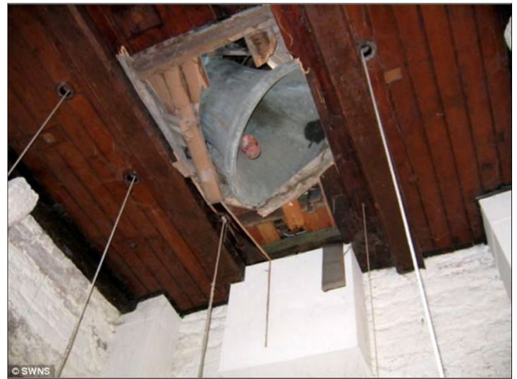
It tolls for thee: The huge bell which crashed through the ceiling of a church in Kilmersdon, Somerset, after a group of bellringers aged up to 90 gave it a hefty tug. Another of the bells is said to be 'hanging by a thread'