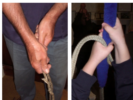
Correct grip on tail-end

The new ringer then imitates the movement. The activity phase should be the largest part of the whole process. It should start with the new ringer performing the actions in slow motion on a static rope with the bell down.