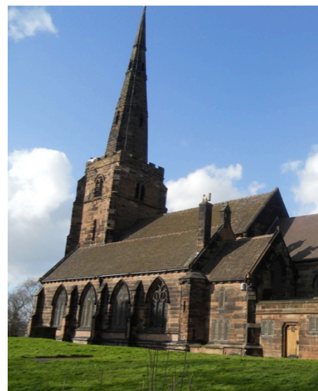
St Michael's Lichfield

We usually get 8 – 12 ringers on a Sunday morning and we rang for two Christmas Eve Services including Midnight Mass. A good sign of an enthusiastic band and I'm really proud of them all.