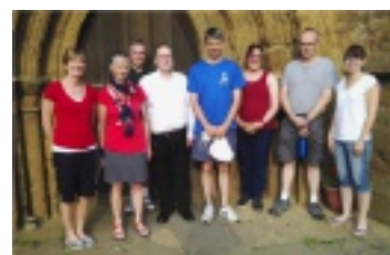
The patriotically coloured band for the Kington QP as part of 90-4-90