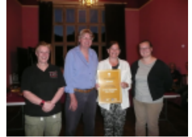
Award Ceremony Isle of Wight

Features that impressed the judges in the Brighstone submission were "Flexibility and responsiveness to the specific development needs of the different age groups and clear planning to address retention".