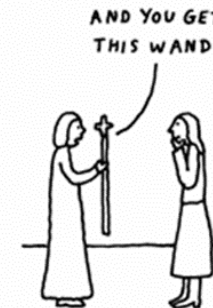
USING A STICK