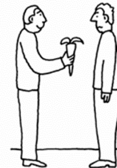
USING A CARROT