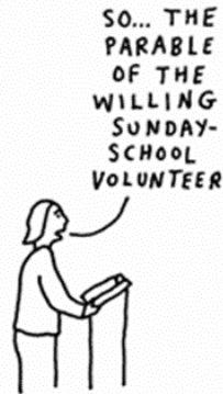
MAKING SUBTLE REFERENCES