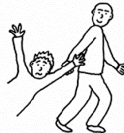
GETTING EXISTING VOLUNTEERS TO BRING FRIENDS